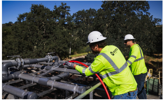
Figure 4. Operators spraying down the nozzles

needed to flush media. This wetting rate is typical for roughing filters and is proven to be effective for this trickling filter.