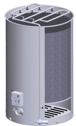
Figure 2. Trickling filter rendering

The media within the filter is Brentwood's VF5000 vertical flow media. This media features an open flute design that is ideal for high loading applications like wineries. The larger flute openings allow for easier sloughing of biomass and avoids clogging, as large