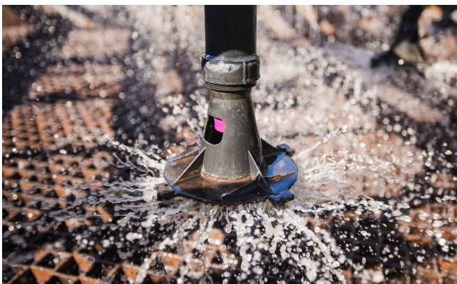
Figure 3: Nozzle distribution system

The typical wetting rate is 1.1 gpm/ft 2 and is doubled once per week in order to flush the media. Isolation valves within the spray nozzle manifold are also used when